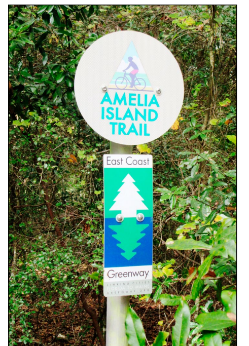
Amelia Island Trail is part of East Coast Greenway.