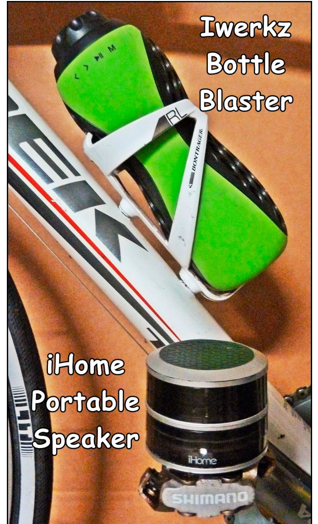
Green Iwerkz speaker for birthday. iHome is small has good volume.

They talk about trending topics in a roundtable format with commentary on bicycle