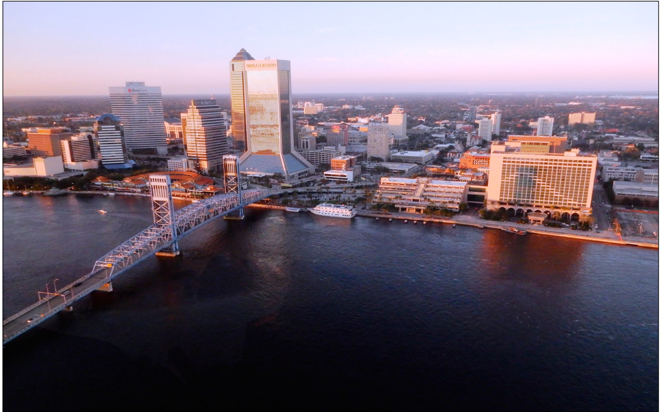
University Club provided party-goers a spectacular view of downtown.