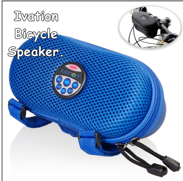
A $25 bike speaker with storage.

The top volume control knob makes volume adjustments a simple task while riding. It also has blue tooth controls, which I