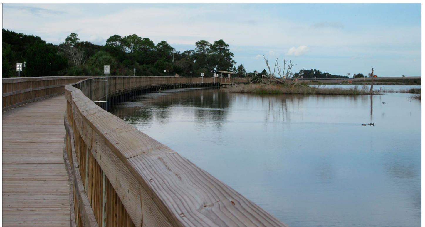
Boardwalk segment of Timucuan Trail provides a fine venue for bird watching, but its north end is closed, which limits access.

“Last I heard, FDOT was pressing on with the crosswalk to be built in spring 2016,”