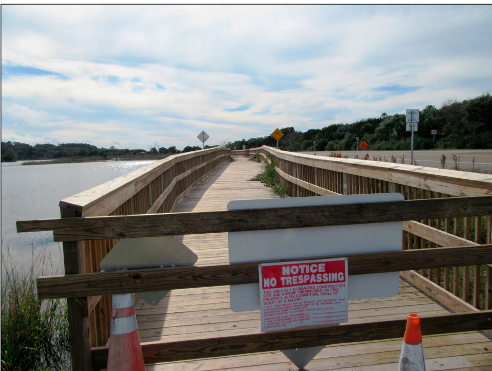
Boardwalk entrance at the Nassau Bridge may open next year after safety concerns are addressed.

A newly built boardwalk, which was intended as a pathway from the Timucuan Trail on Big Talbot Island to a bridge across the Nassau River, stops just short of the bridge.